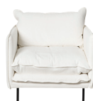
armchair CHA150 90 x 90 x H80cm

please allow up to an additional 10cm overall for cushion overhang