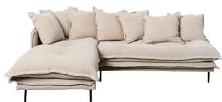
modular sofa LOU133 - left facing 250 x 97 x H80cm