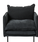
armchair CHA149 90 x 90 x H80cm