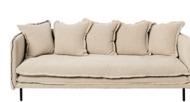
three-seater sofa LOU139 210 x 98 x H80cm