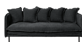
three-seater sofa LOU140 210 x 98 x H80cm