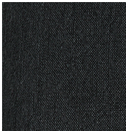
100% black linen