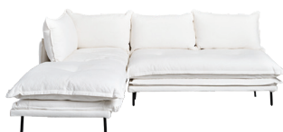
modular sofa LOU131 - left facing 250 x 97 x H80cm