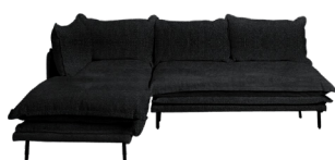
modular sofa LOU135 - left facing 250 x 97 x H80cm