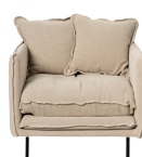
armchair CHA151 90 x 90 x H80cm