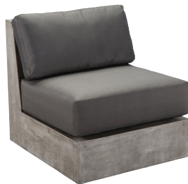
LOU068 extension seat D80xL80xH70cm