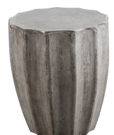
TAB245 waterlily D39xH46cm