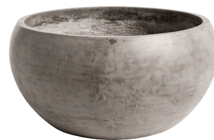
PLT177 large D66xH33cm