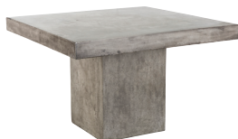
TAB 157 square dining table 120x120xH77cm