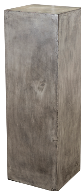
STA017 large 40x40xH121cm