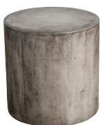
TAB143 round sm D40xH40cm