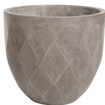
PLT179 medium D50xH46cm