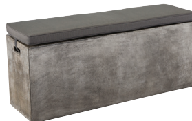
BEN003 small 120x35xH47cm