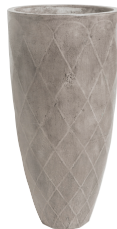
PLT183 large D50xH100cm