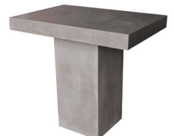
TAB 283 bar table – sm 100x70xH92cm