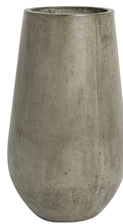
PLT112 xlarge D57xH100cm