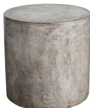
TAB146 round lge D50xH50cm