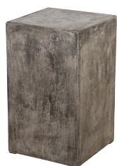
STA015 small 40x40xH67cm