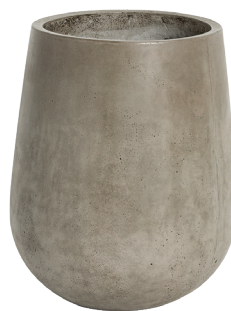
PLT111 large D56xH67cm