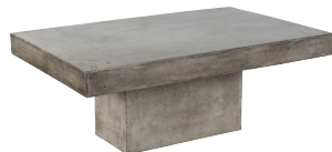
TAB 129 rectangular coffee table – sm 120x80xH47cm