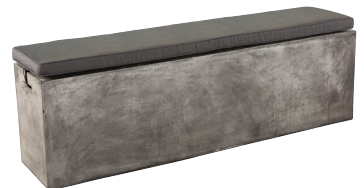
BEN004 large 160x35xH47cm