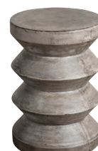
TAB184 chevron D31xH44cm