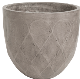
PLT180 large D60xH54cm