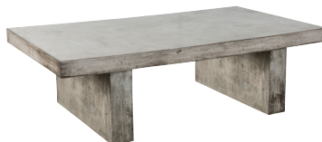
TAB142 rectangular coffee table – lge 160x90xH47cm