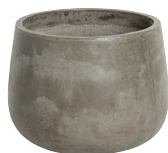
PLT108 large D56xH41cm