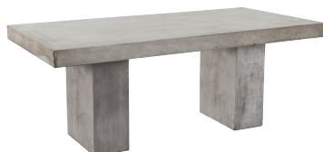
TAB127 rectangular dining table 200x100xH77cm