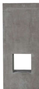
PLT196 small tall 60x30xH105cm