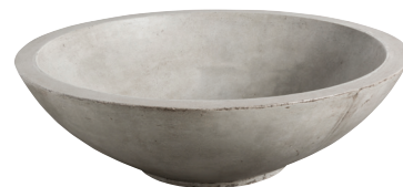
BOW377 water bowl D70xH20cm