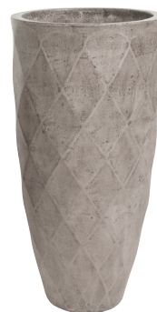
PLT182 medium D40xH80cm