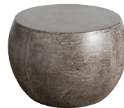
TAB185 scoop table D50xH30cm

Raphael pieces are hand made in Vietnam with fibre-reinforced cement. A composite material of natural fibres, cement, stone powder and natural latex-based waterproofing agent make the range durable and suitable for both outdoors and commercial use. While it is heavy each piece is fragile and should be treated with the utmost care when transporting, assembling and placing the pieces. The units are all lightly sealed with a wax sealant. Repeat periodically to prevent staining. Spills should be wiped up immediately. Owing to materials used, natural colour variations will occur.