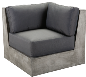
LOU067 corner seat D80xL80xH70cm

One year warranty for major manufacturing defects. Warranty does not cover damage in transit, handling or relocation. Due to the nature of the material, natural colour variations will occur over time. Care instructions must be followed.