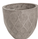
PLT178 small D40xH37cm