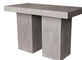
TAB284 bar table – lge 140x70xH92cm