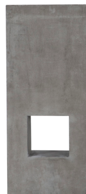
PLT198 large tall 60x30xH140cm