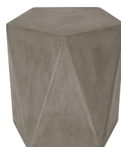
TAB282 pentagon D45xH46cm