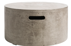
TAB 246 round occasional table D60xH30cm