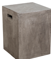
TAB130 square 35x35xH46cm