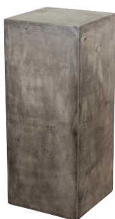
STA016 medium 40x40xH94cm