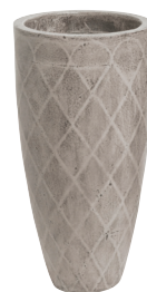
PLT181 small D30xH60cm