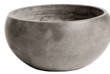
PLT176 medium D50xH25cm