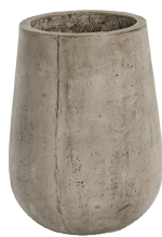
PLT110 medium D37xH51cm