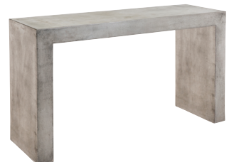
TAB 131 console 140x45xH83cm