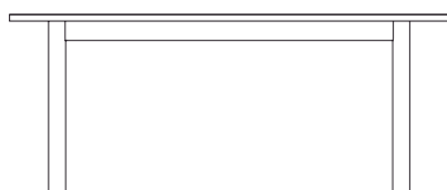
dining table sm180x90xH76cm TAB343