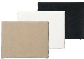
queen bedhead 160 x H130cm